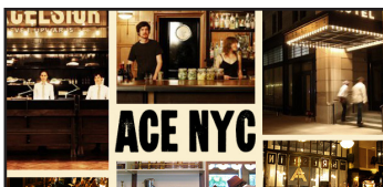
The Ace Hotel: 20 W 29th St