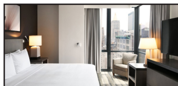
Hyatt House Chelsea: 815 6th Ave